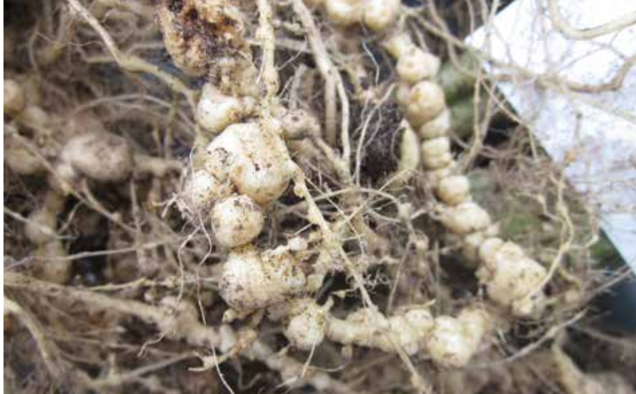
Impaired root system of cucumber by Meloidogyne in the greenhouses of PCG