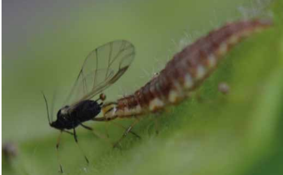
Larva of the lacewing fly that is feeding on aphid